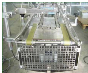
•In-feed pacer unit